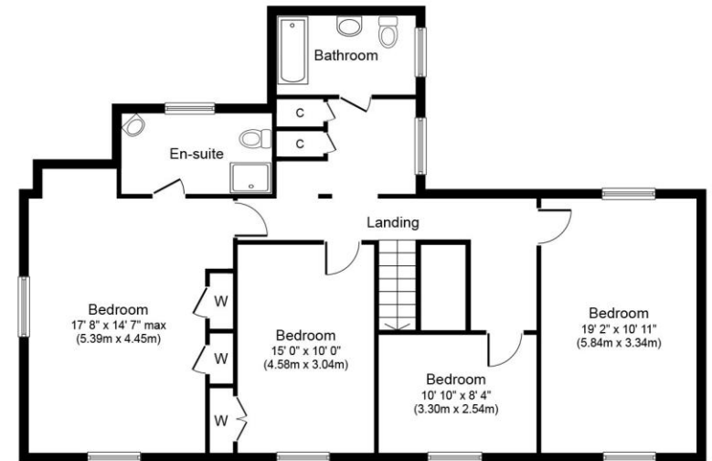
First Floor Approximate Floor Area 1,053 sq. ft. (97.8 sq. m.)

Whilst every attempt has been made to ensure the accuracy of the floor plan contained here, measurements of doors, windows, rooms and any other items are approximate and no responsibility is taken for any error, omission, or mis-statement. The measurements should not be relied upon for valuation, transaction and/or funding purposes. This plan is for illustrative purposes only and should be used as such by any prospective purchaser or tenant.