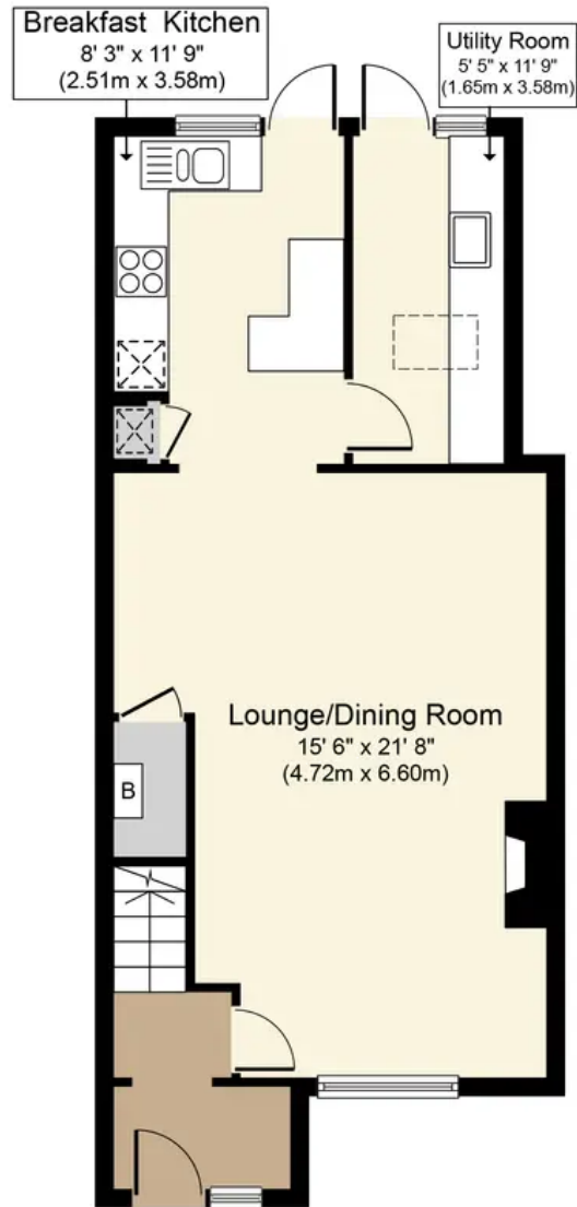
Ground Floor Approximate Floor Area 513 sq. ft. (47.7 sq. m.)