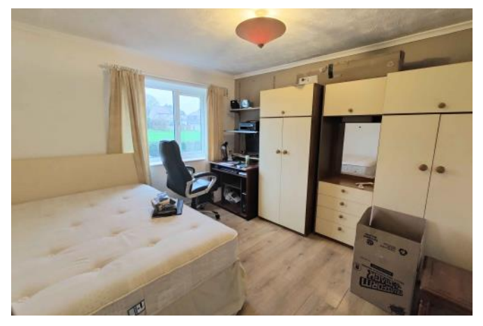
A large second bedroom offering space for a