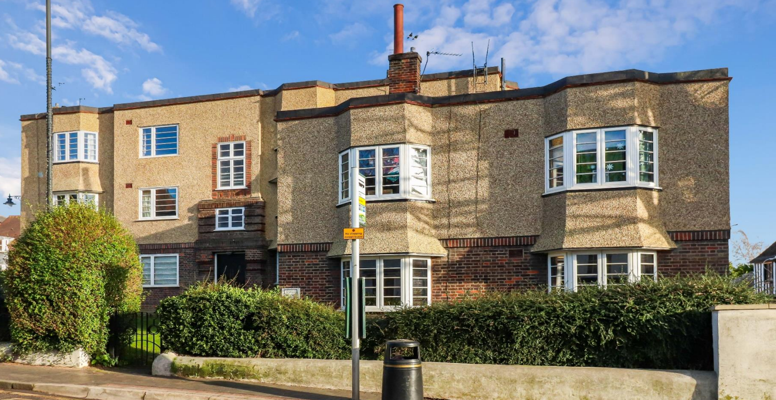
Abbey Court, Holywell Hill, St Albans