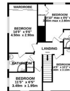
1ST FLOOR 630 sq.ft. (58.5 sq.m.) approx.