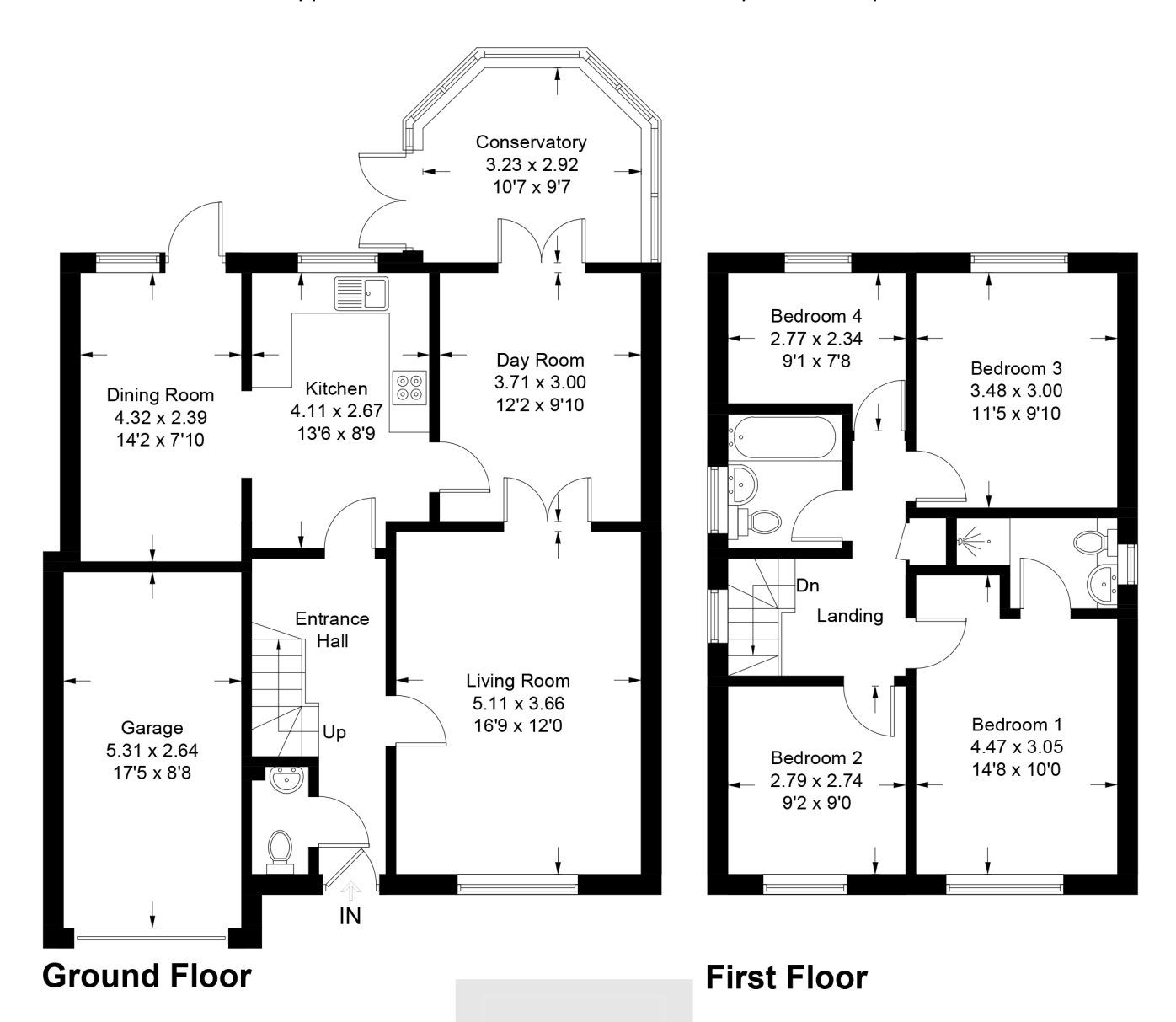
Illustration for identification purposes only, measurements are approximate, not to scale. FloorplansUsketch.com © 2023 (ID1013123)

Approximate Gross Internal Area = 139.4 sq m / 1500 sq ft