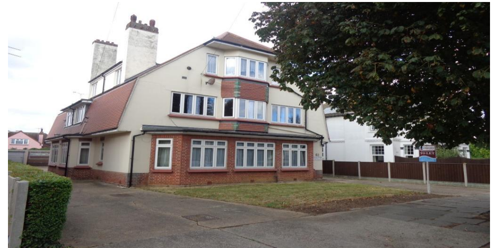
Victoria Road Clacton-on-Sea

Rent: £850 pcm Energy Efficiency Rating C