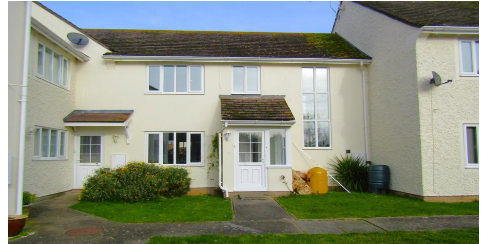
St Marys Mews