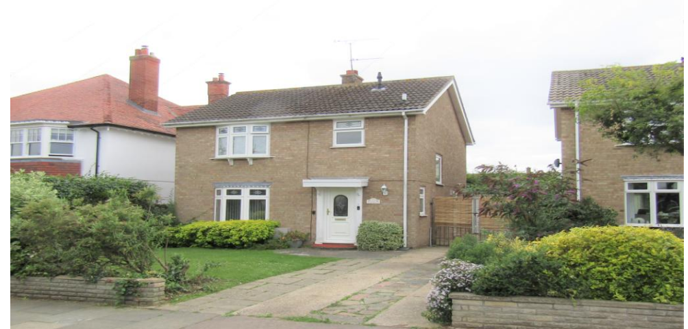
Queens Road Frinton-on-Sea

Rent: £1,550 pcm Energy Efficiency Rating E