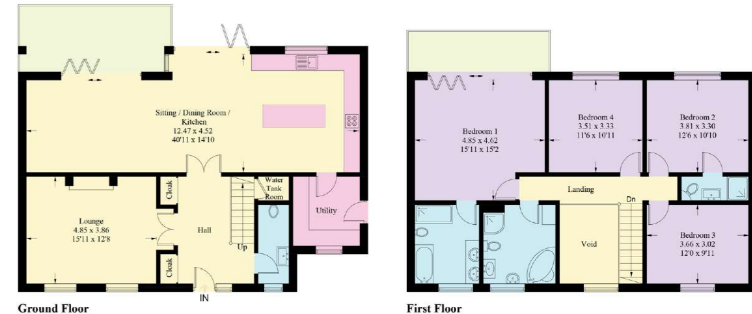
Illustration for identification purposes only, measurements are approximate, not to scale. floorplansUsketch.com © (ID1022572)

Approximate Gross Internal Area = 194.0 sq m / 2088 sq ft