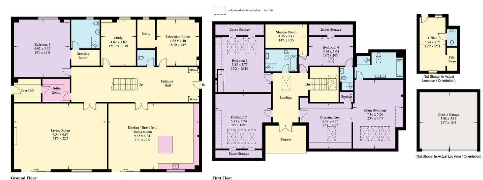
Illustration for identification purposes only, measurements are approximate, not to scale. floorplansUsketch.com © (ID1028665)