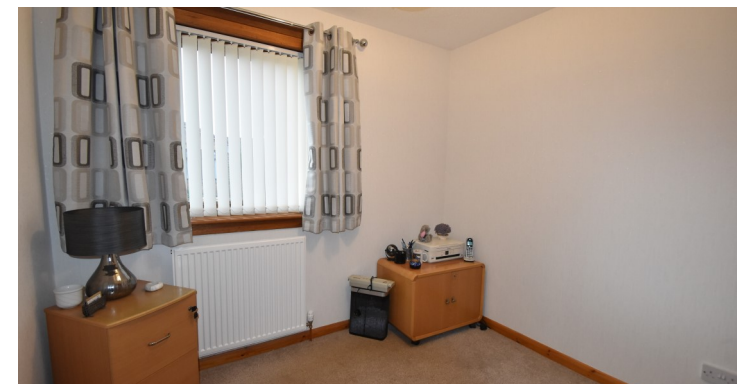
20 East Bankton Place