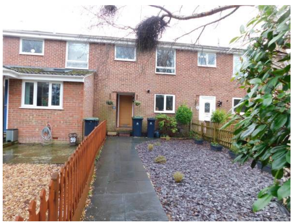
SITUATED IN THE SEMI RURAL VILLAGE OF BURTON IS THIS EXTREMELY WELL PRESENTED AND EXTENDED FAMILY HOME.

THIS DELIGHTFUL PROPERTY OVERLOOKS THE CENTRAL GREEN TO THE FRONT AND HAS ACCOMMODATION COMPRISING ENTRANCE HALL, MODERN KITCHEN, WELL PROPORTIONED LOUNGE, CONSERVATORY/DINING ROOM WITH BI-FOLD DOORS ONTO THE REAR GARDEN, FIRST FLOOR LANDING, 3 BEDROOMS AND A MODERN CONTEMPOARY BATHROOM. BENEFITS CONVEYED WITH THE PROPERTY INCLUDE A GARAGE IN A NEARBY BLOCK, DOUBLE GLAZING, GAS FIRED CENTRAL HEATING, POPULAR LOCATION, CLOSE TO LOCAL SHOPS AND AMENITIES AND ATTRACTIVE FRONT AND REAR GARDENS.