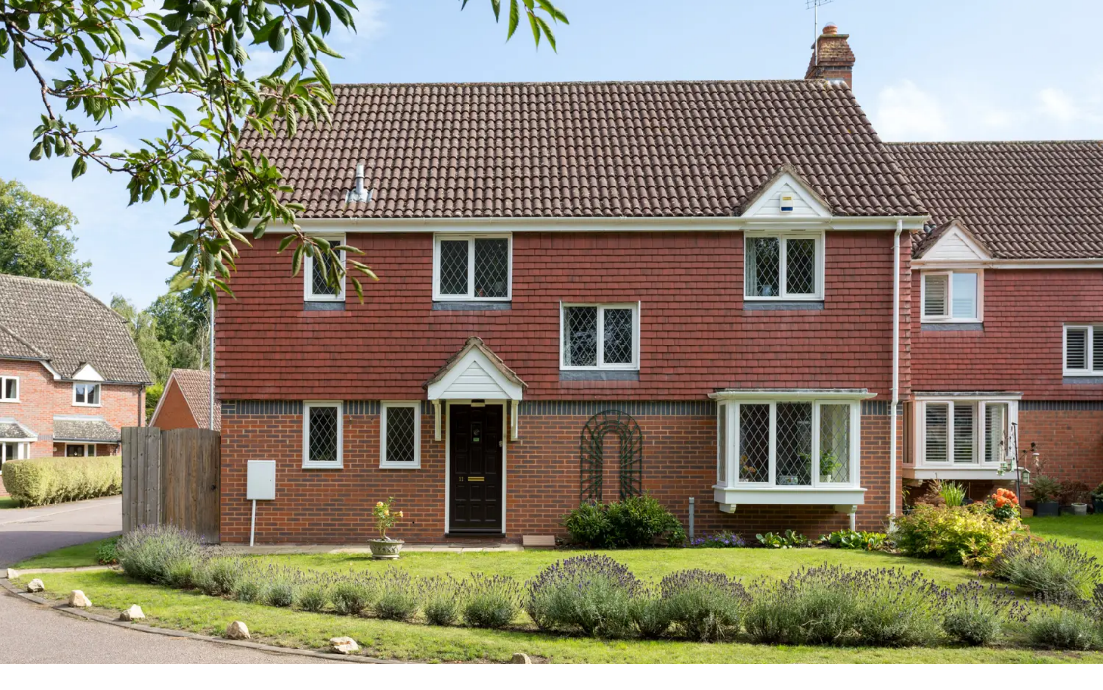
11 Manor Close, Brampton Guide Price £535,000