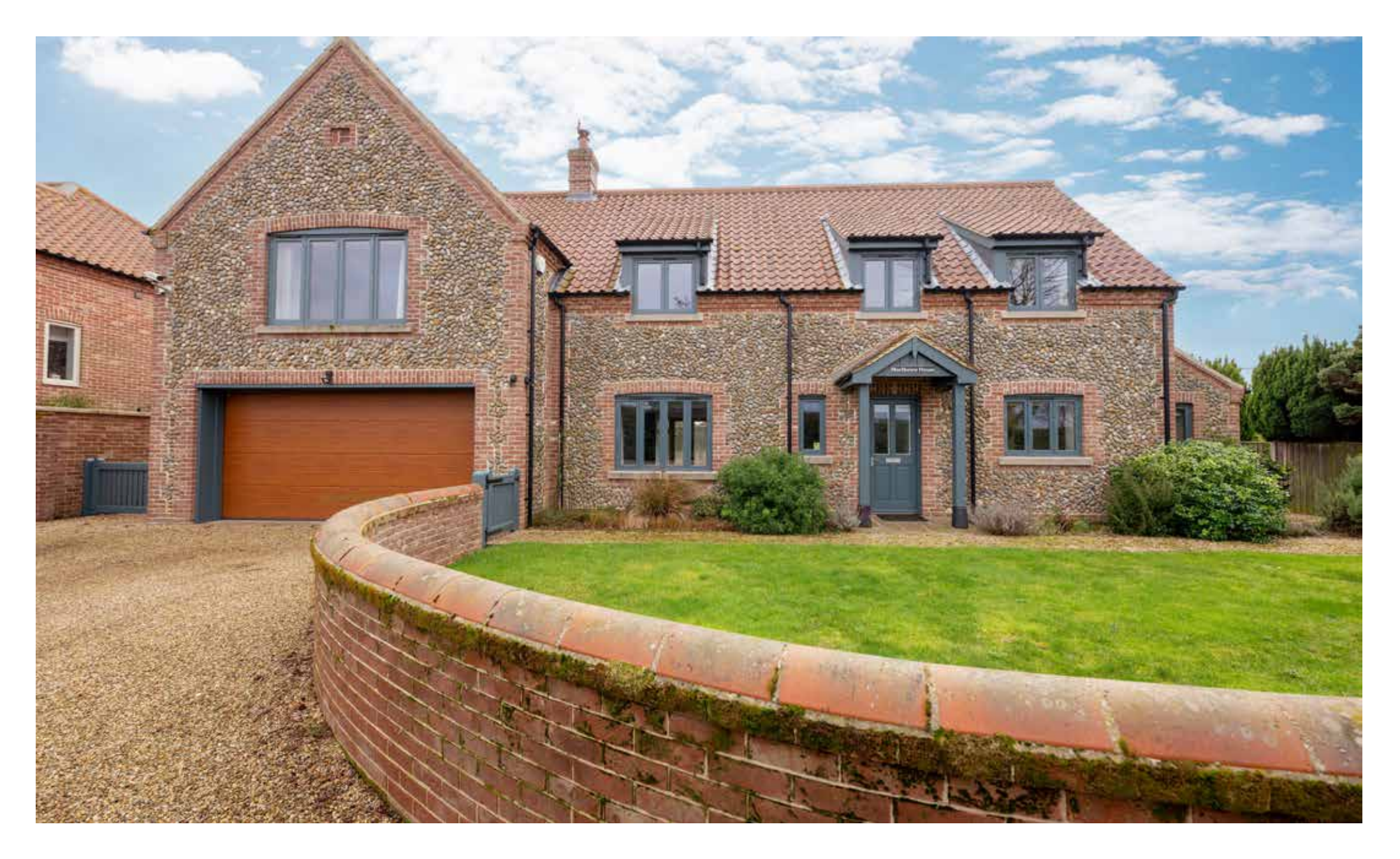
Northview House Wighton | Norfolk | NR23 1GB