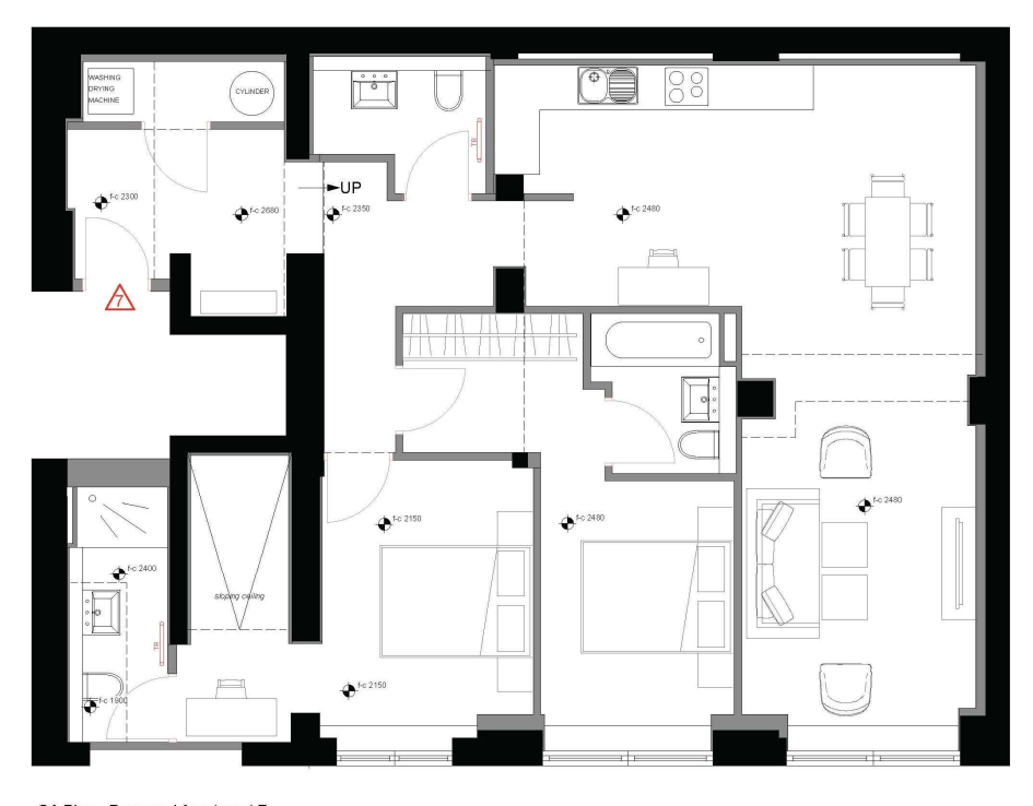
GA Plan - Proposed Apartment 7