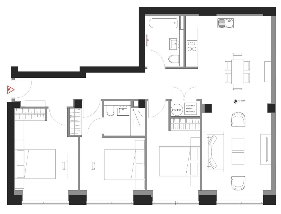
GA Plan - Proposed Apartment 5