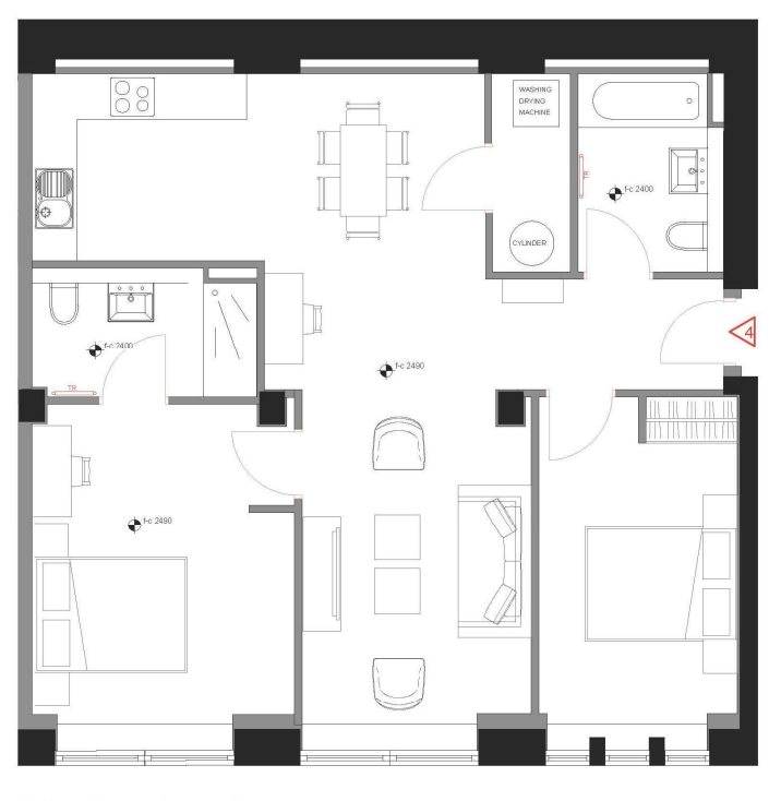
GA Plan - Proposed Apartment 4