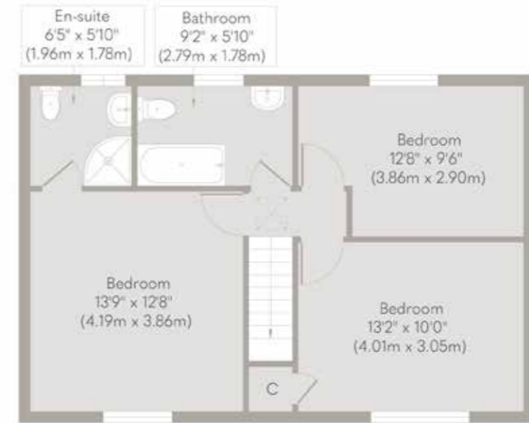
First Floor Approximate Floor Area 561 sq. ft (52.11 sq. m)