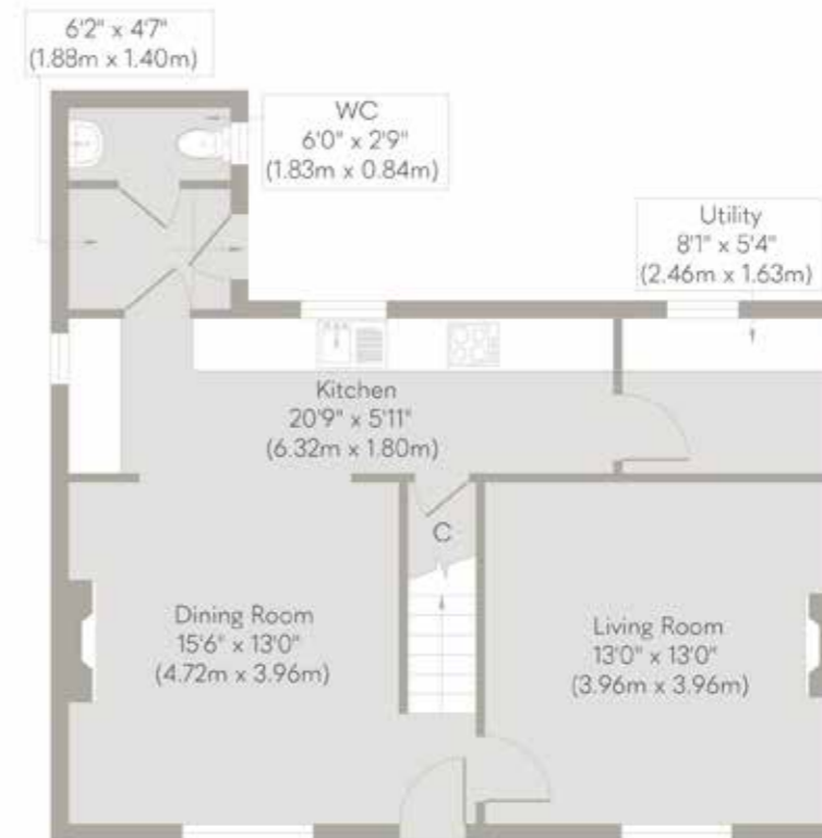
Ground Floor Approximate Floor Area 611 sq. ft (56.76 sq. m)

Whilst every attempt has been made to ensure the accuracy of the floor plan contained here, measurements of doors, windows, rooms and any other items are approximate and no responsibility is taken for any error, omission, or mis-statement. This plan is for illustrative purposes only and should be used as such by any prospective purchaser or tenant. The services, systems and appliances shown have not been tested and no guarantee as to their operability or efficiency can be given.