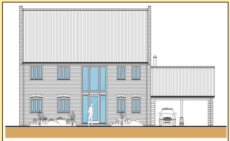
PLOT 2 FRONT ELEVATION