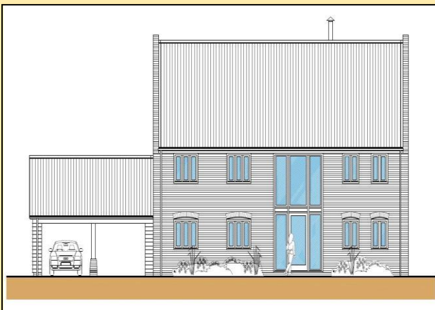
PLOT 1 FRONT ELEVATION

Electricity: Western Power Distribution - New Supplies - Customer Application Team, Tollend Road, Tipton, DY4 0HH - Email: wpdnewsuppliesmids@westernpower.co.uk CALL: 0121 623 9007