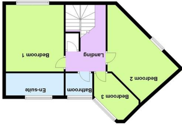
First Floor Approx. 554.4 sq. feet