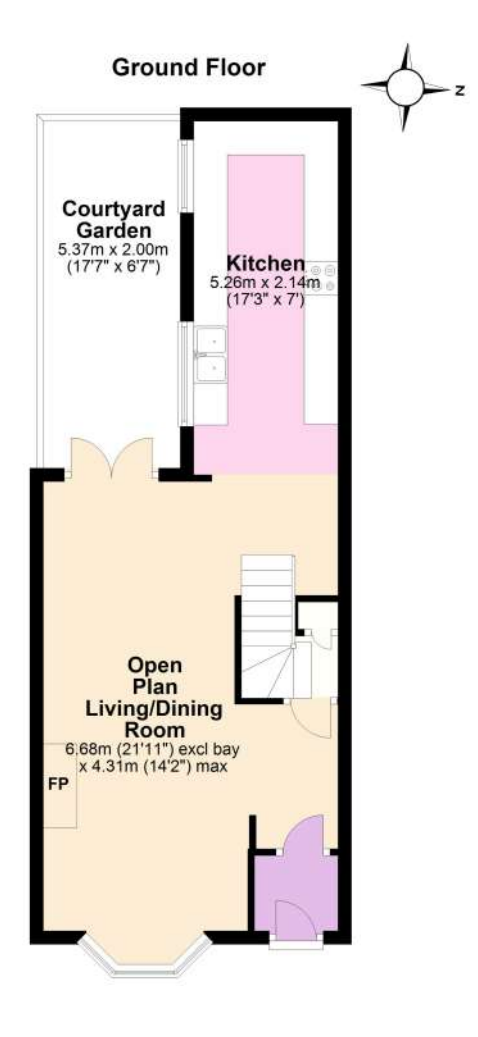
Total Floor Area Approx. 85m<sup>2</sup> (914 sq ft)