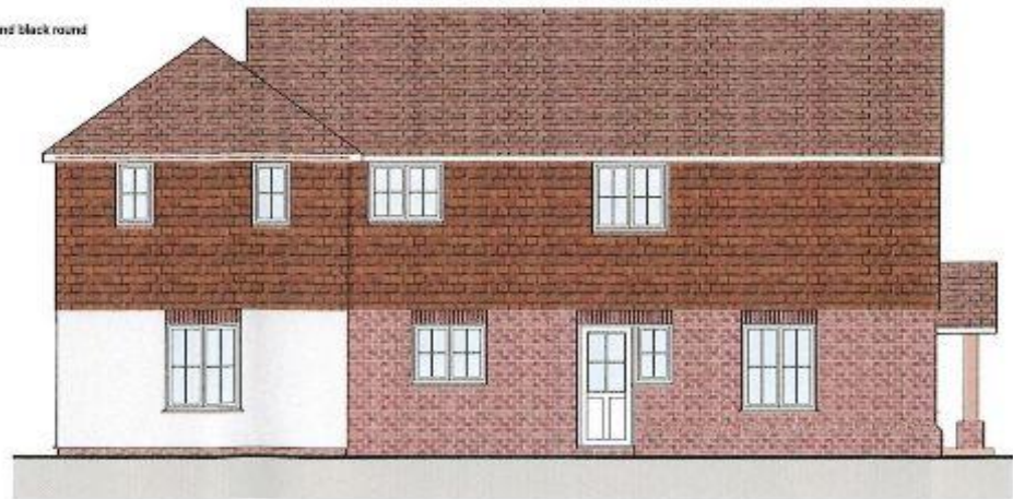
Proposed North (flank) Elevation