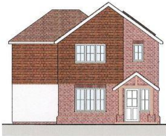
Proposed West (front) Elevation