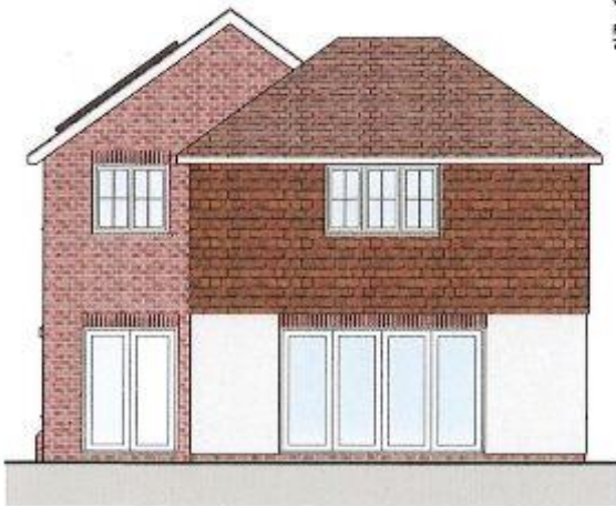
Proposed East (rear) Elevation

Rainwater goods - black half round upvc gutters and black round 75mm dia downpipes