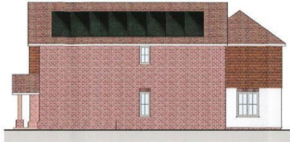
Proposed South (flank) Elevation