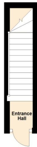
Ground Floor Approx. 3.5 sq. metres (37.5 sq. feet)