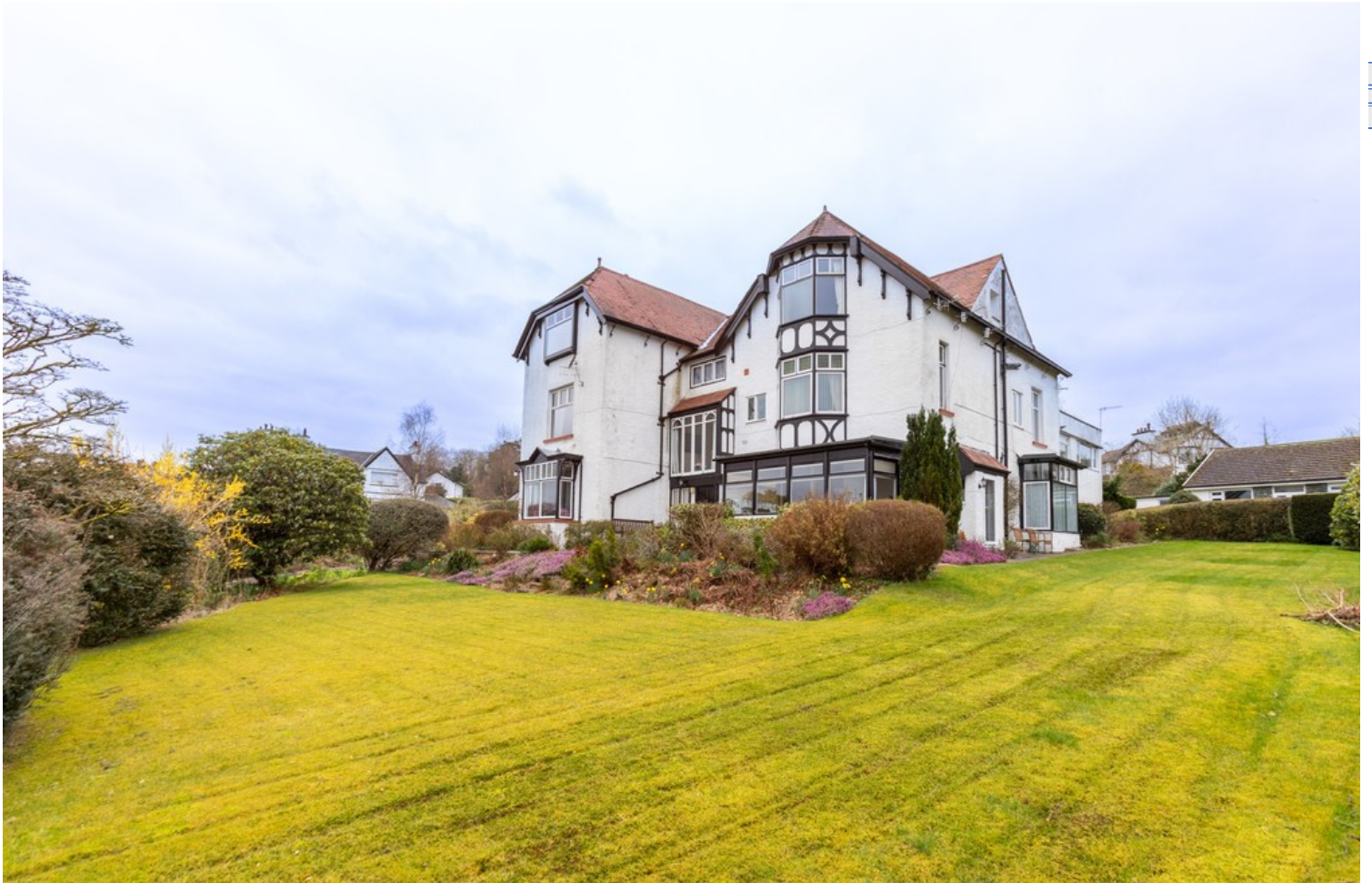
Rear of Rotherwood