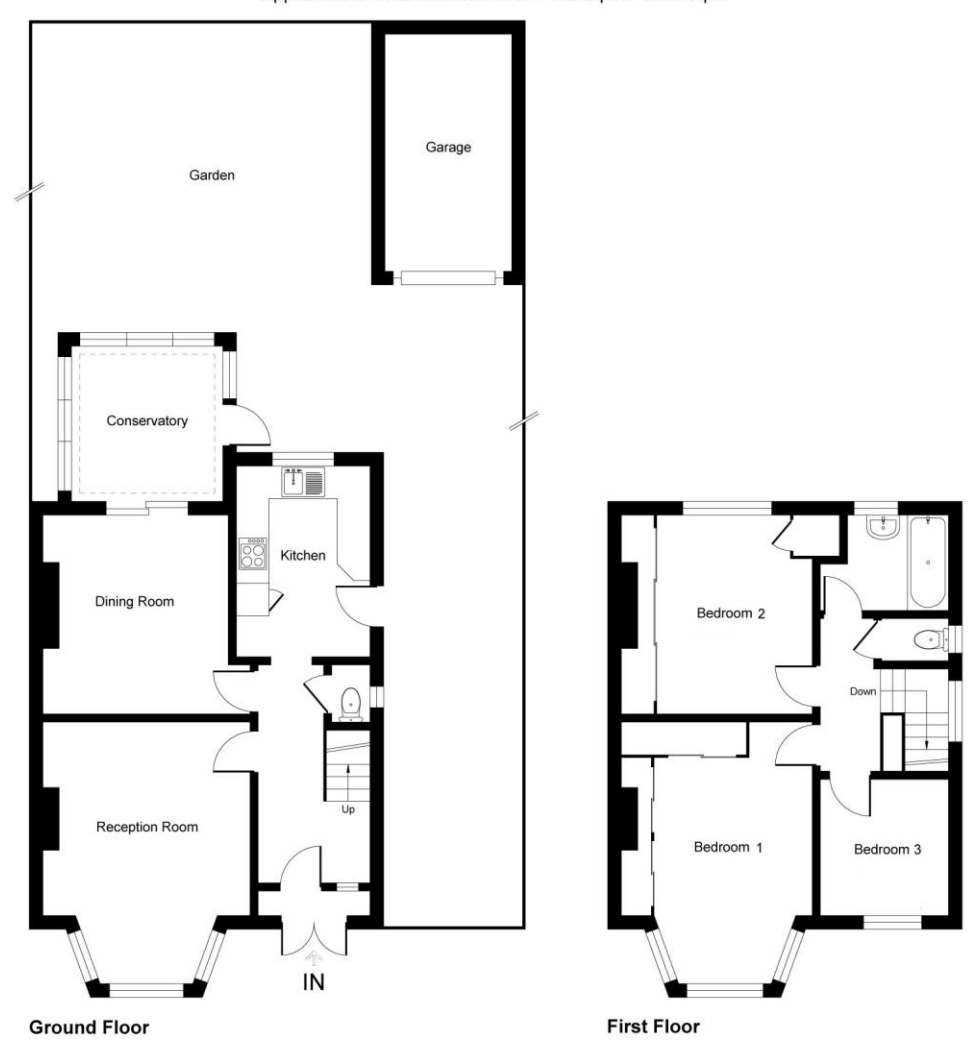
This plan is for layout guidance only. Not drawn to scale unless stated. Windows and door openings are approximate. Whilst every care is taken in the preparation of this plan, please check all dimensions, shapes and compass bearings before making any decisions reliant upon them. Produced by Planpix

Footscray Road, SE9 Approximate Gross Internal Area = 108 sq m / 1162 sq ft Approximate Garage Internal Area = 10 sq m / 112 sq ft Approximate Total Internal Area = 118 sq m / 1274 sq ft