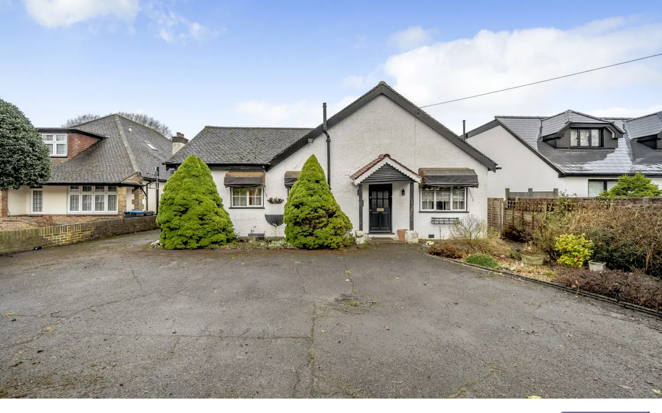
203 Farleigh Road, Warlingham - CR6 9EH Guide Price £625,000