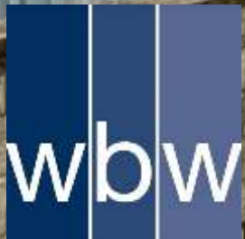
5 Sharphaw View Gargrave