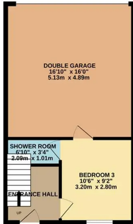
GROUND FLOOR 438 sq.ft. (40.7 sq.m.) approx.