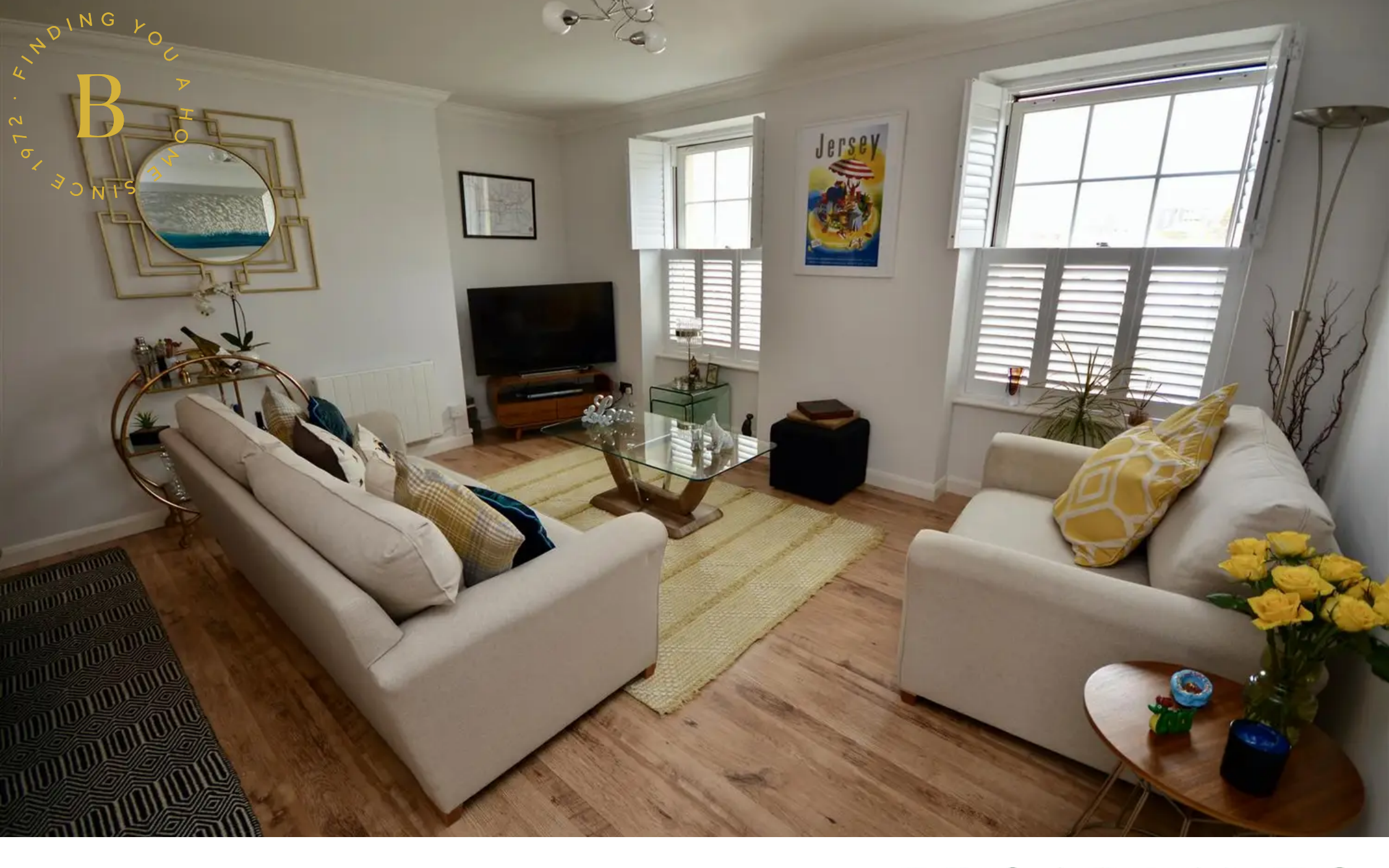
Flat 2, 4 Grosvenor Terrace Grosvenor Street, St. Helier, JerseBROADLANDS £489,000