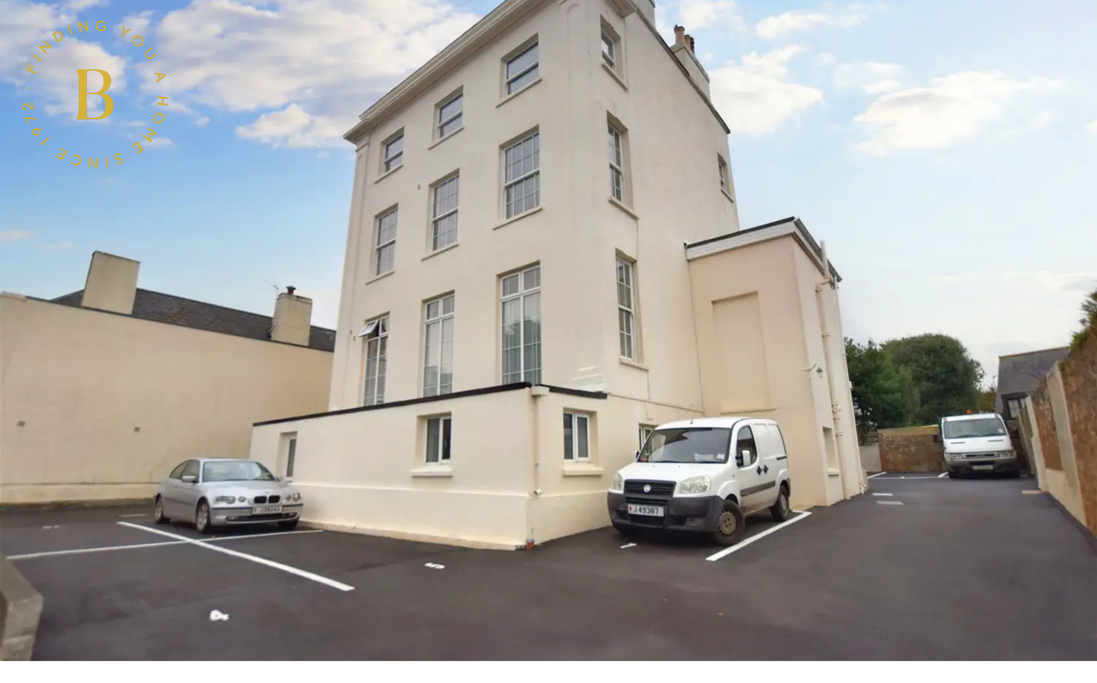
Flat 10, Ashley House, St. Saviours Hill, St. Saviour, Jersey £415,000