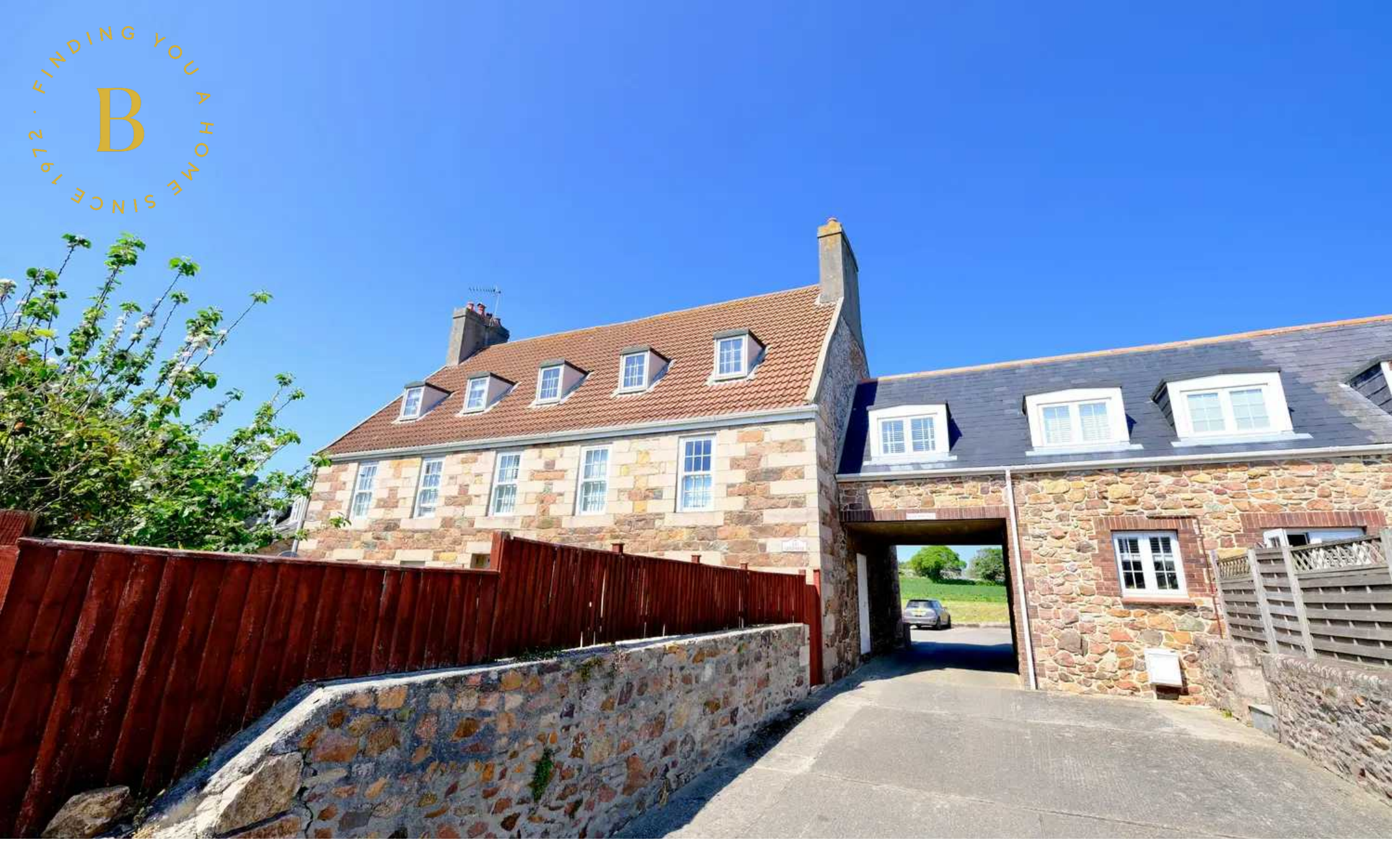
5 La Chesnaie, La Grande Route De Faldouet, St. Martin £695,000