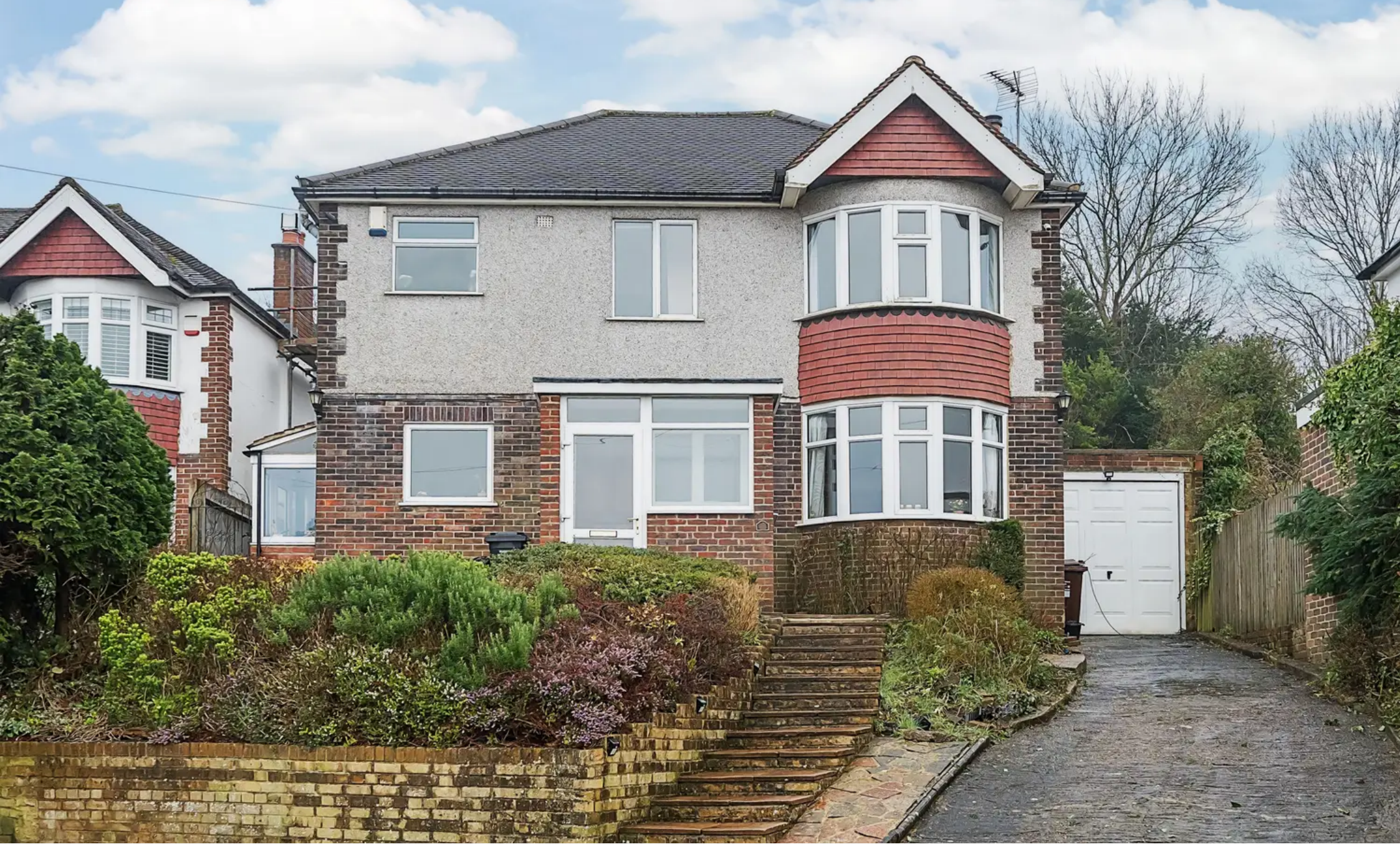
20 Court Farm Road, Warlingham - CR6 9BD Guide Price £725,000