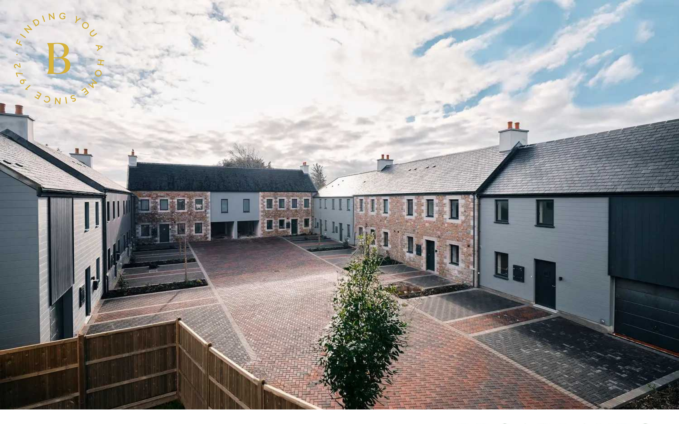
5 & 8 Clos Du Manoir, La Route du Manoir, St Peter £1,150,000