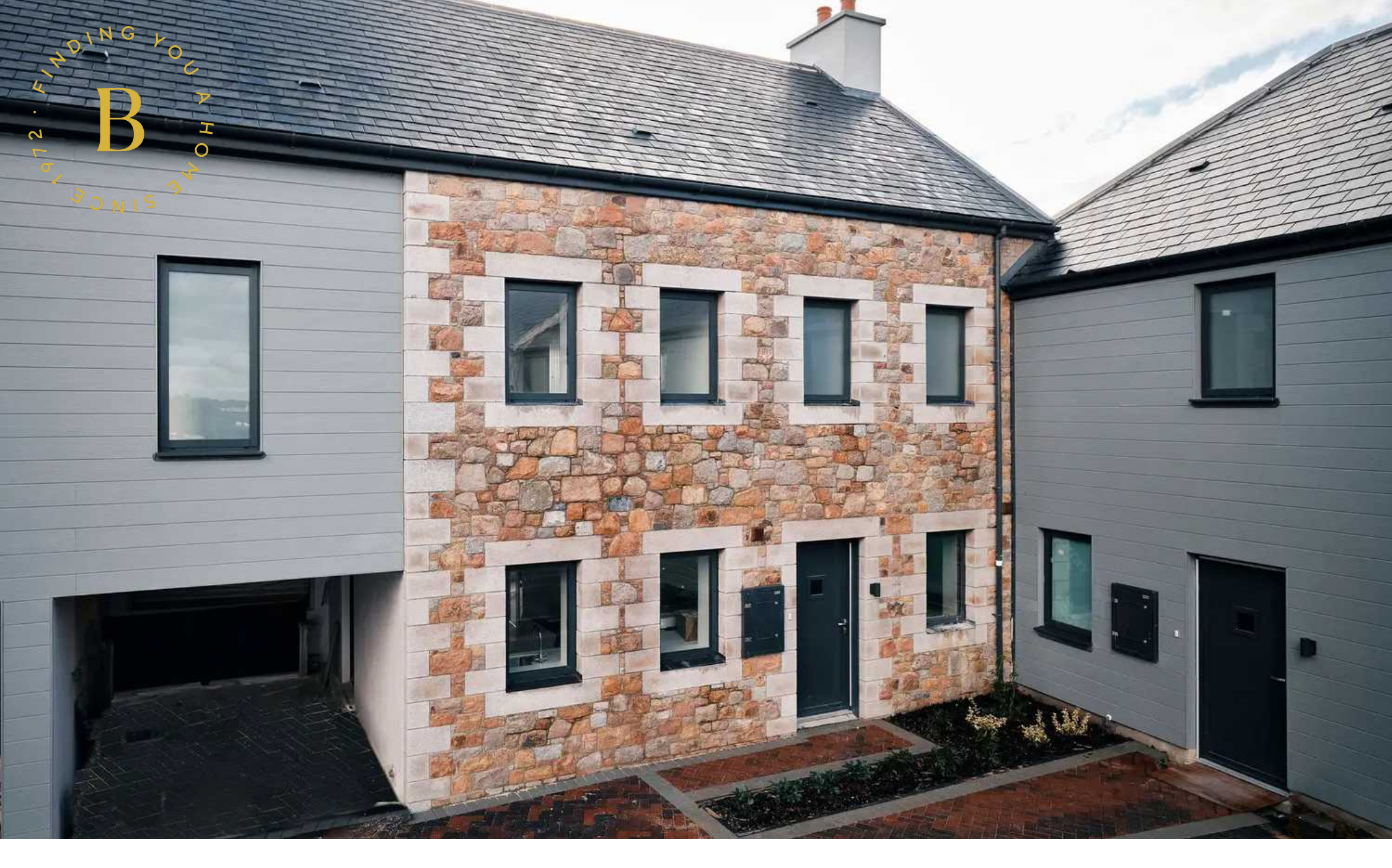
6 & 7 Clos Du Manoir, La Route du Manoir, St Peter £1,350,000