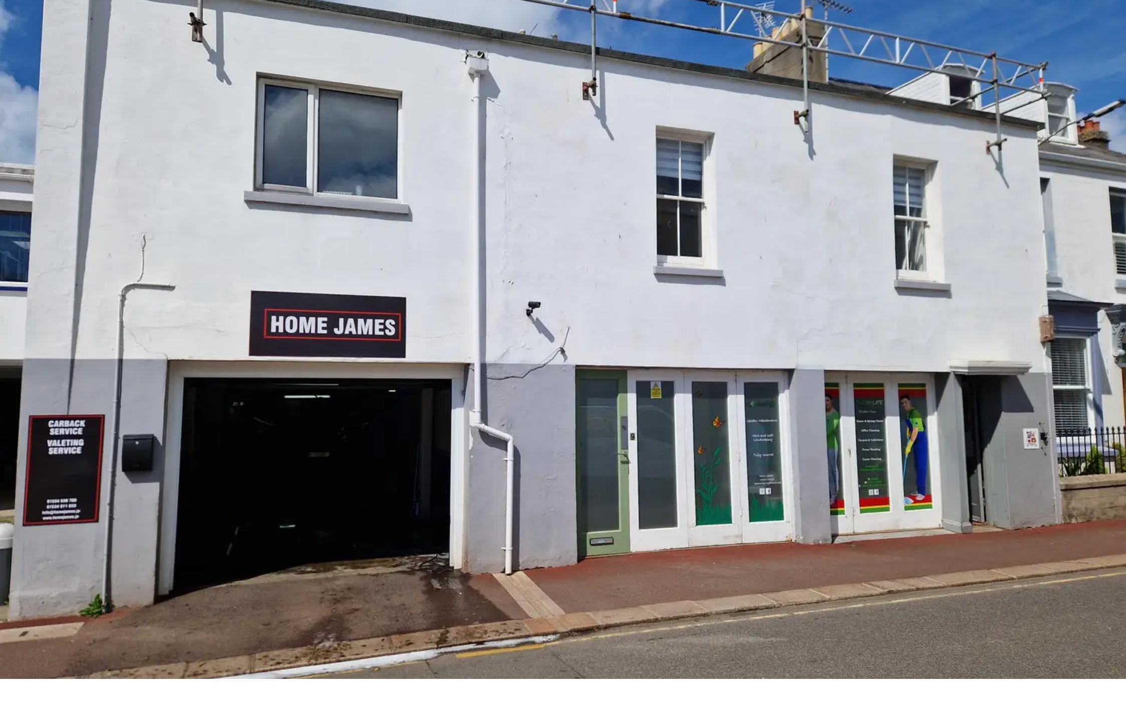
First floor offices, 9 Great Union Road, St.Helier £22,296 pa