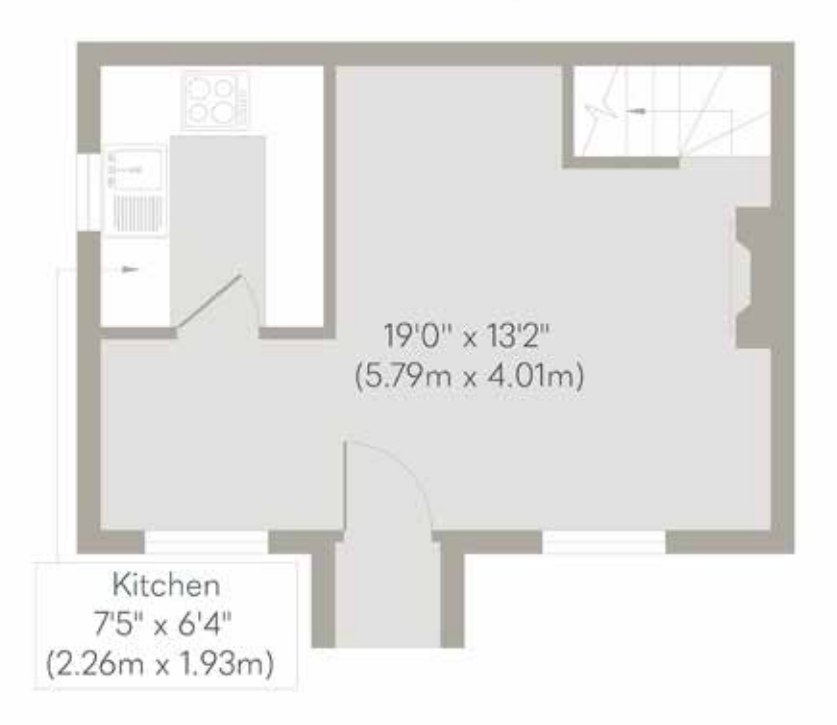
Ground Floor Approximate Floor Area 250 sq. ft (23.24 sq. m)

First Floor Approximate Floor Area 250 sq. ft (23.24 sq. m)