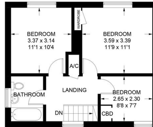
First Floor 42.0 sq m / 452 sq ft

Illustration for identification purposes only, measurements are approximate, not to scale.