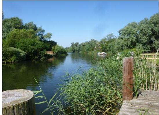
View towards Geldeston