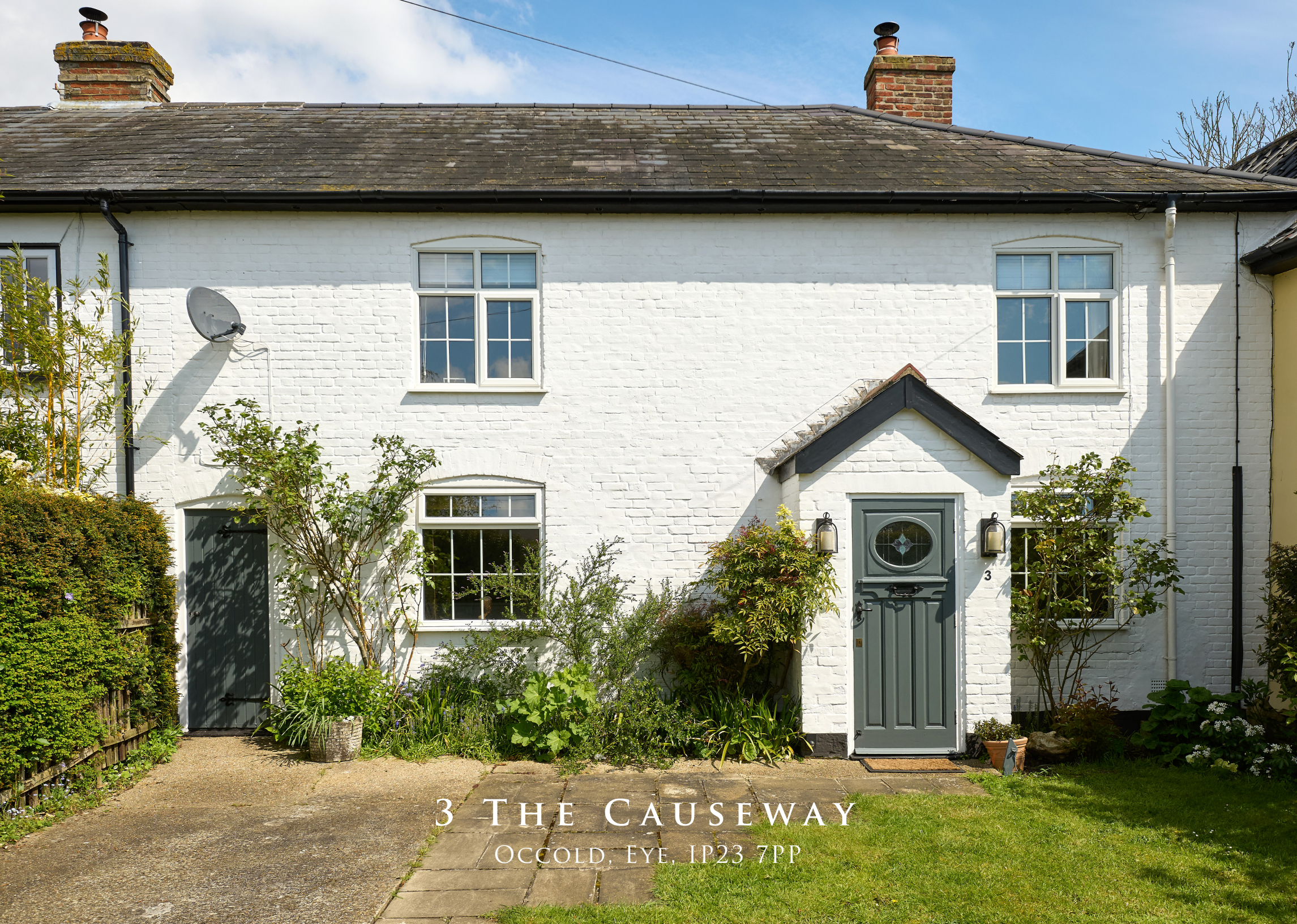
3 THE CAUSEWAY OCCOLD, EYE, IP23 7PP