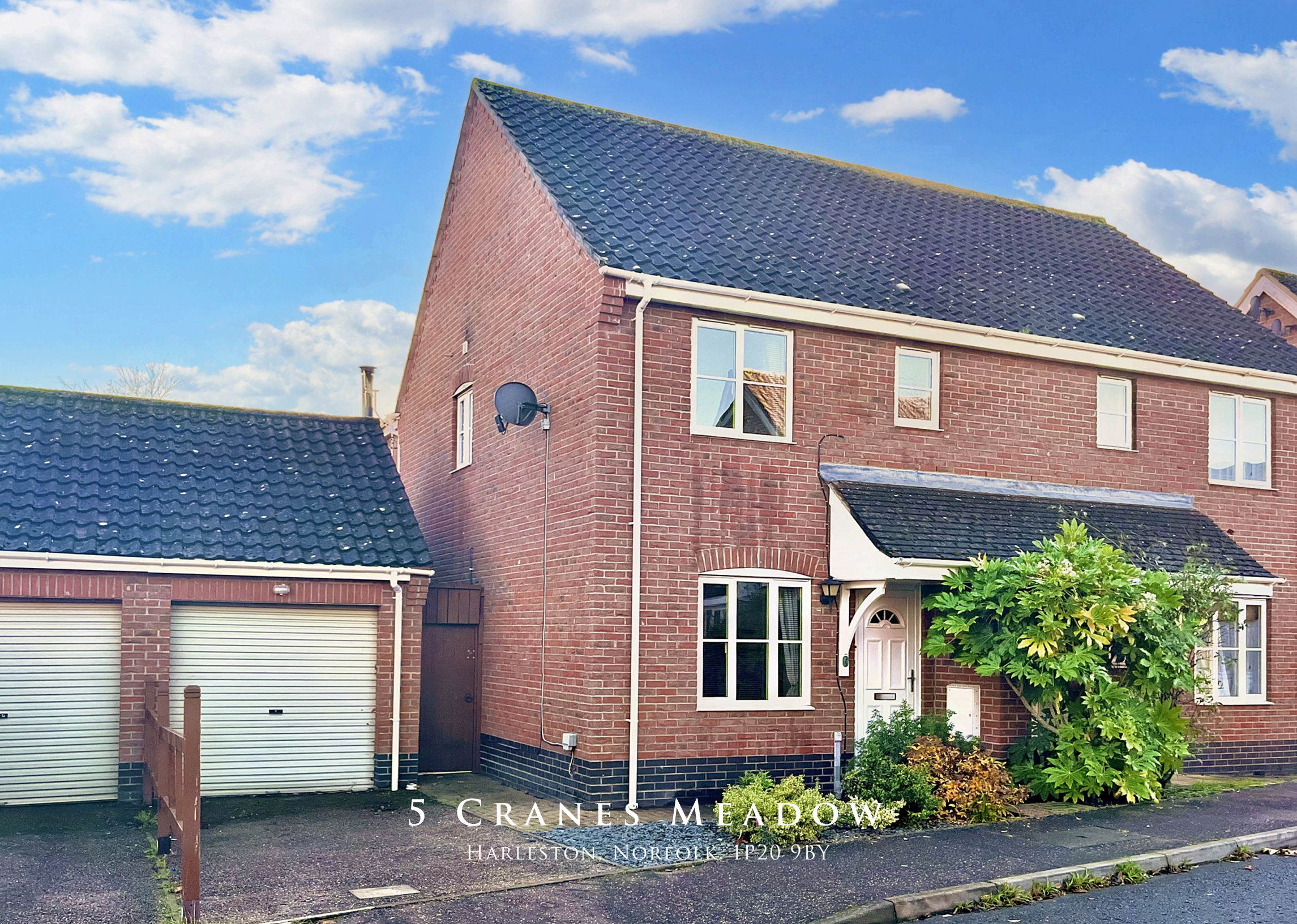
5 CRANES MEADOW HARLESTON, NORFOLK IP20 9BY