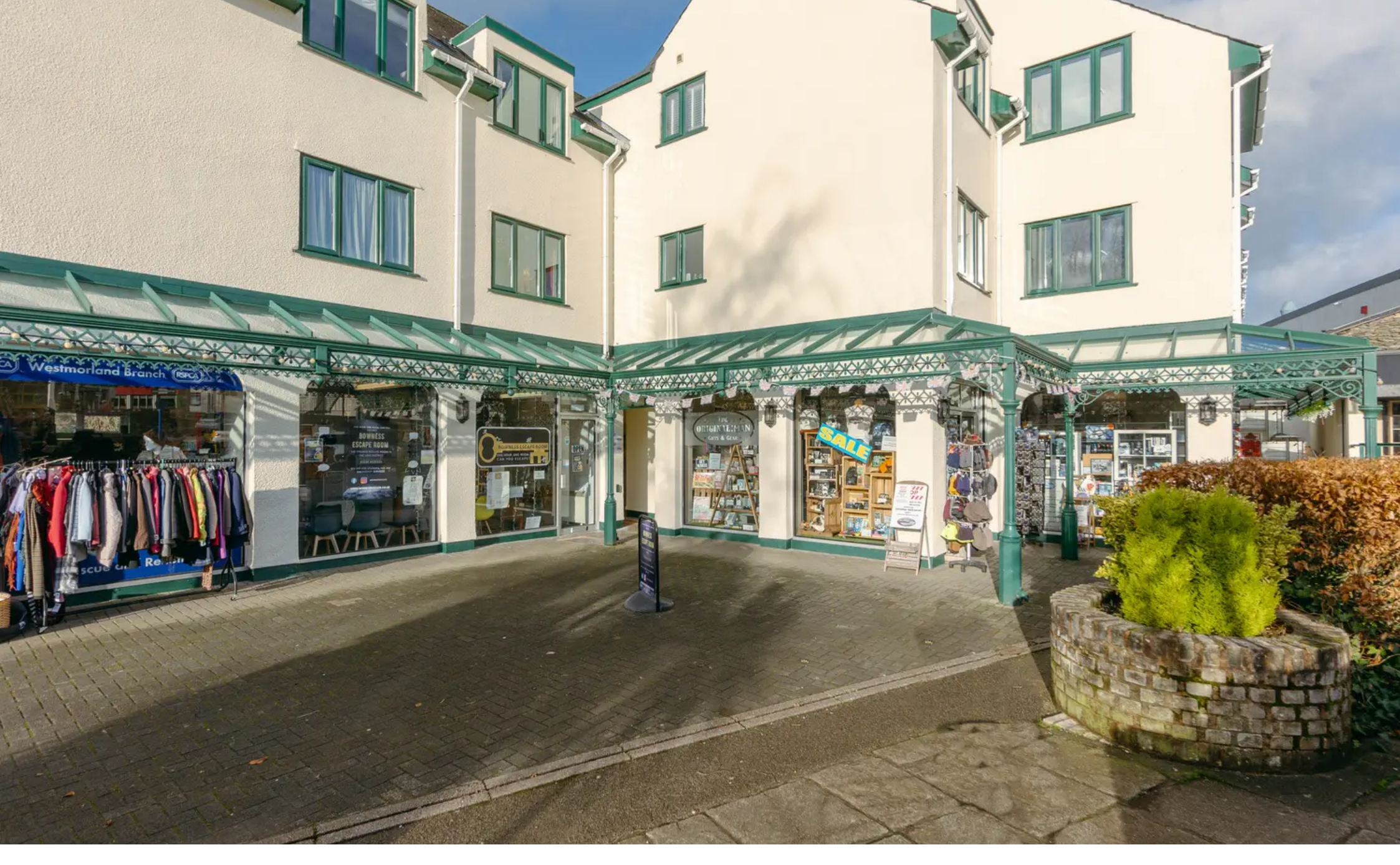
Eve's Attic, 45a Quarry Rigg, Bowness-On-Windermere £219,000