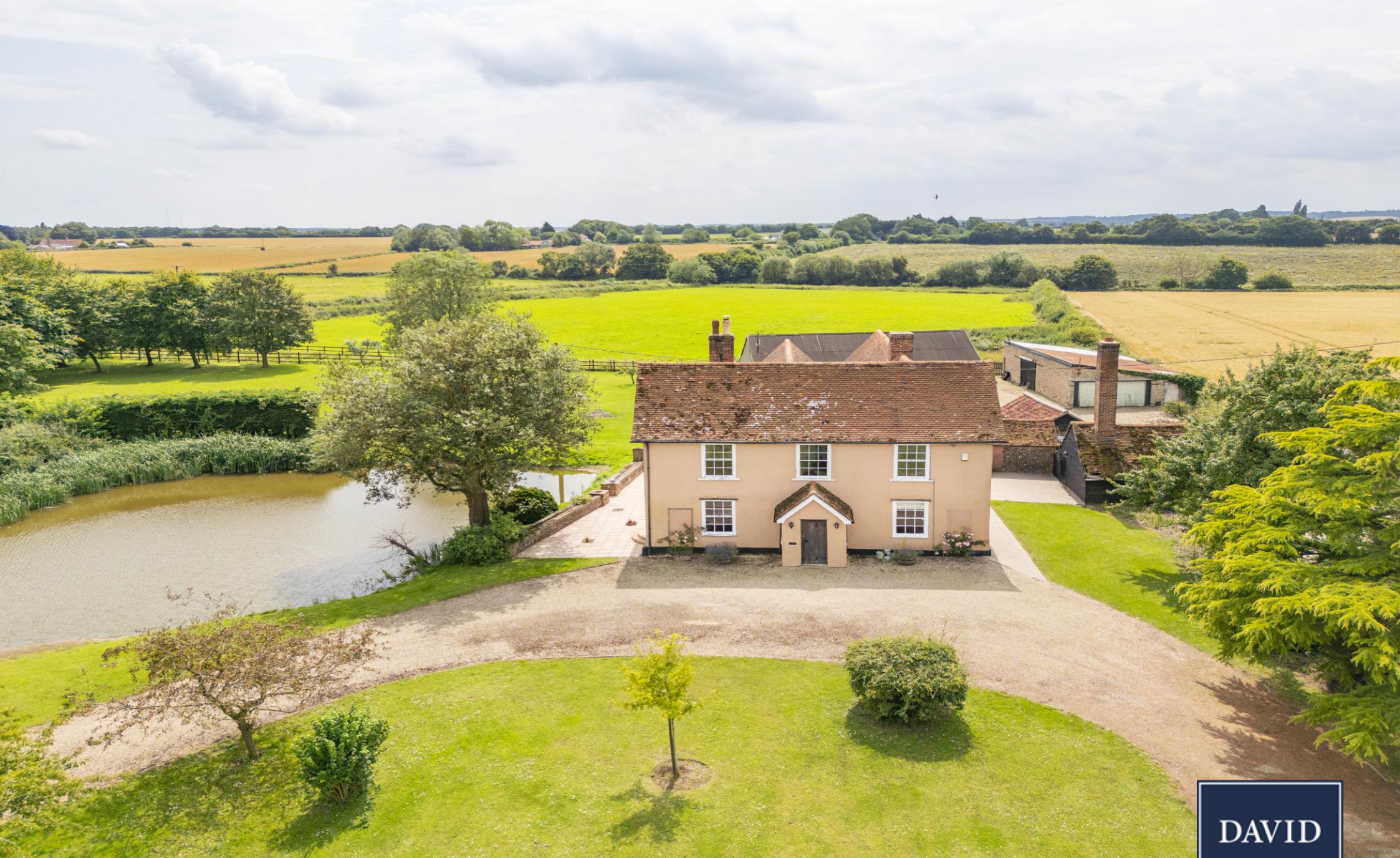
Cuckoo Tye Farmhouse, Cuckoo Tye, Acton, Suffolk