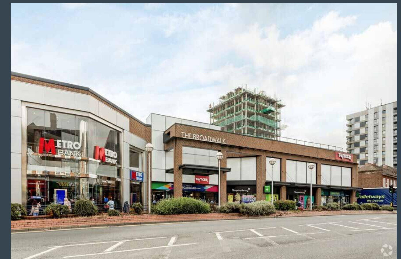
THE BROADWALK SHOPPING CENTRE