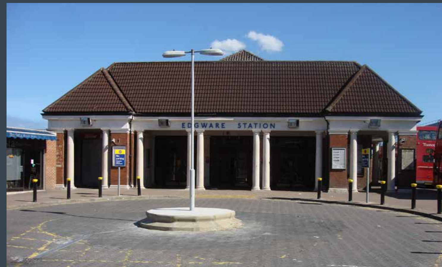
EDGWARE UNDERGROUND STATION