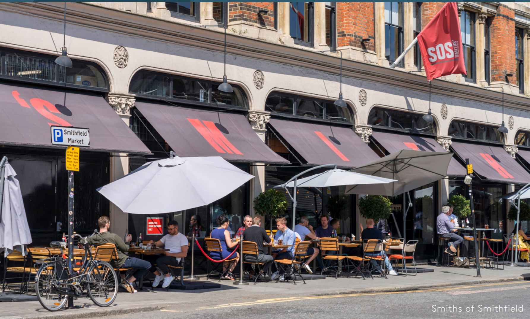
Smiths of Smithfield