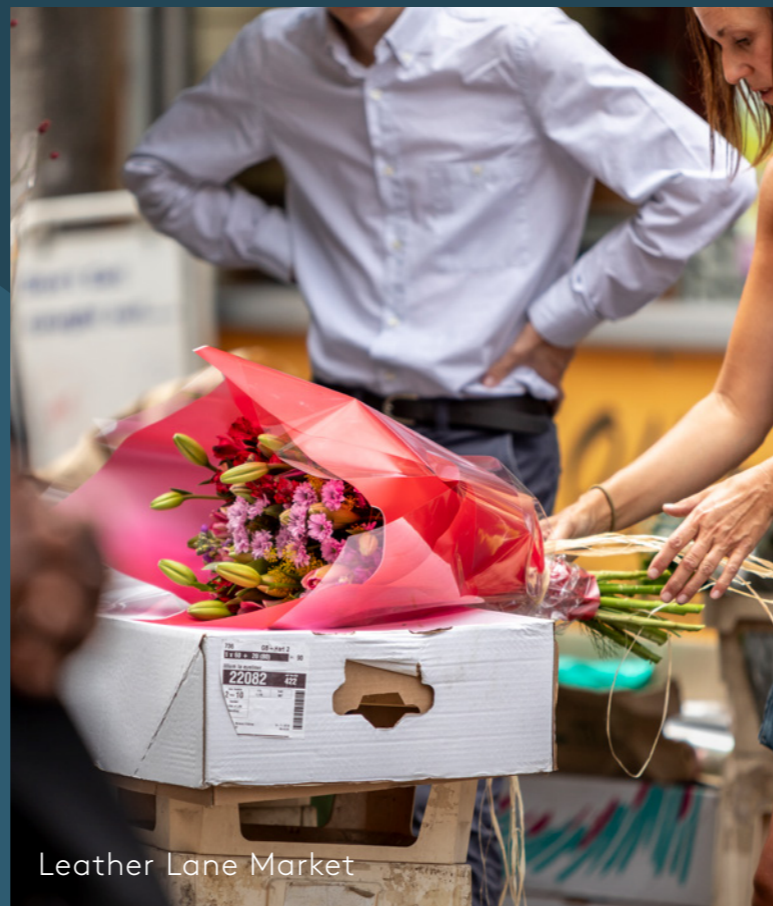
Leather Lane Market