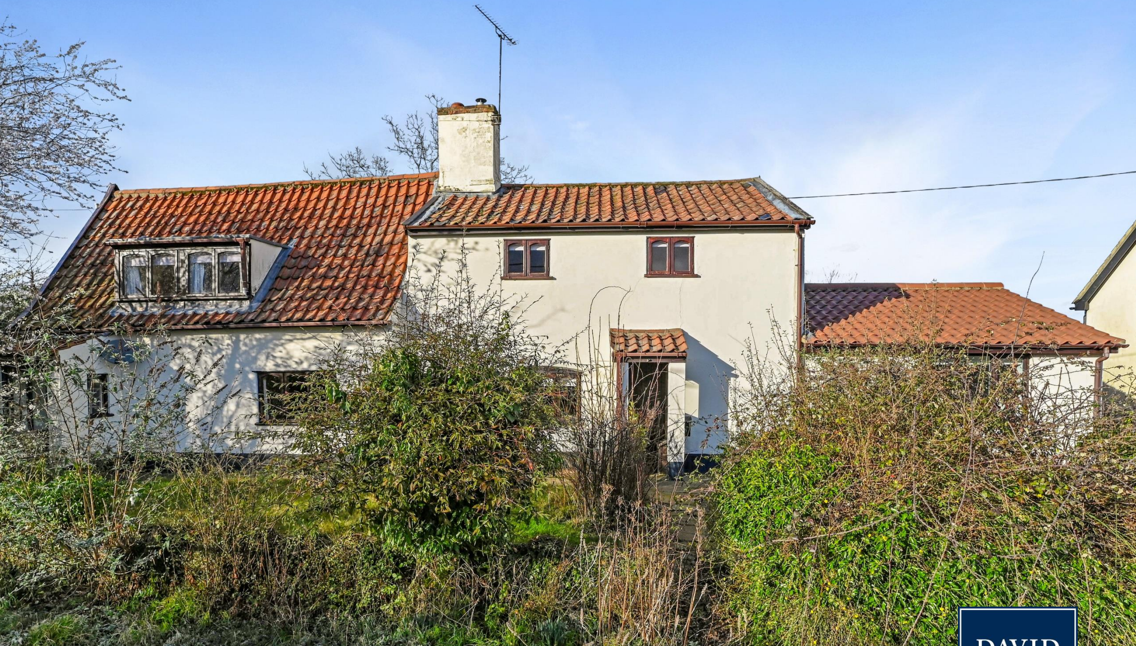
Chesil Cottage Drinkstone, Suffolk