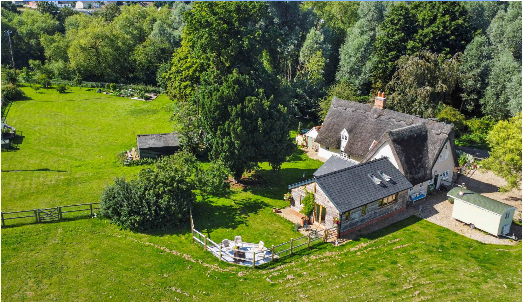
Fordwater Cottage | Wixoe