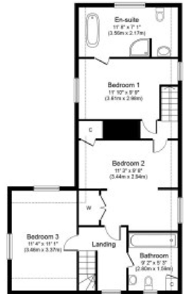
First Floor Approximate Floor Area 877 sq. ft. (81.5 sq. m.)

Agents notes: All measurements are approximate and for general guidance only and whilst every attempt has been made to ensure accuracy, they must not be relied on. The fixtures, fittings and appliances referred to have not been tested and therefore no guarantee can be given that they are in working order. Internal photographs are reproduced for general information and it must not be inferred that any item shown is included with the property. For a free valuation, contact the numbers listed on the brochure. Copyright Â© 2020 Fine & Country Ltd.