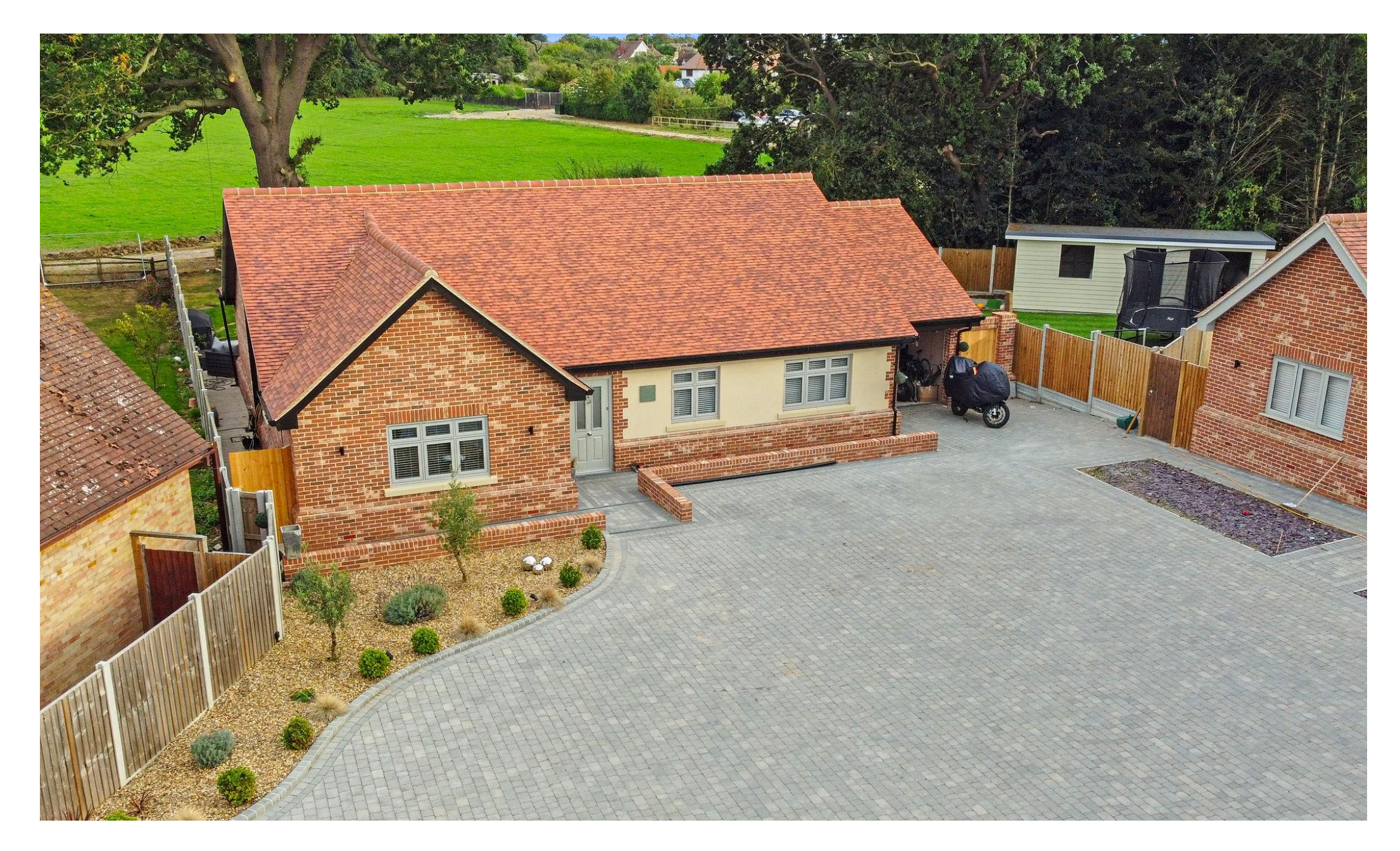
Oakview Malting Lane | Kirby-le-soken | CO13 0EH