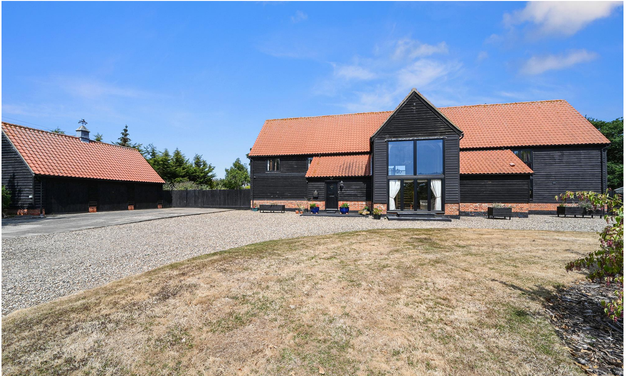
Warren Lodge Park Chase, St. Osyth, Colchester, Essex, CO16 8HG