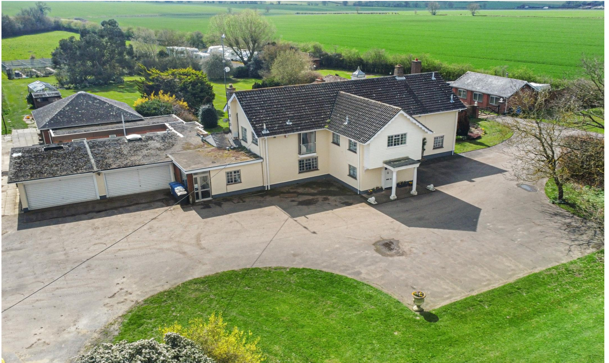
Newmans Hall Little Waldingfield, Sudbury, Suffolk, CO10 0SY